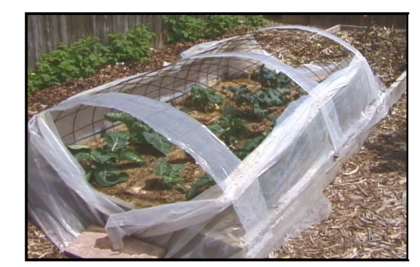
Figure 3. Cold frame for a raised-bed garden made from concrete reinforcing mesh covered with 4-mil plastic. Notice the belt-like plastic straps, which hold the covering in place. The covering is slid between the straps and mesh to open and close. Pictured open for ventilation on a warm day.

An easy cold frame structure for a growing bed is made with 4-mil clear plastic (polyethylene film) draped over concrete reinforcing mesh. The structure is easily opened during warm days and closed for cold nights. It works well with a 4-foot wide, raised-bed garden system. [Figure 3]