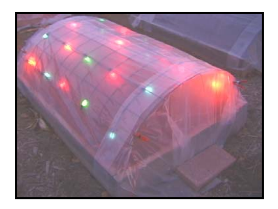
Figure 8. Cold frame with Christmas tree light for additional warmth.

<u>Christmas tree lights</u> – For additional protection, add Christmas tree lights inside the cold frame. In Fort Collins trials, one 25 light string of C-7 (midsize) Christmas lights per frame unit (four feet wide by five feet long) gave 6^{\circ} F to over 18^{\circ} F frost protection. Lights were hung on the frame under the plastic and turned on at dusk and off at dawn. Christmas lights work better than a single, large light bulb in the center by eliminating cold corners and edges. [Figure 8]