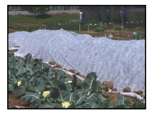
Figure 2. Floating row cover on broccoli and cabbage, protecting crops from

Floating row covers are popular in commercial vegetable production where crops planted in large blocks are easily covered with row covers. Many brands and fabric types are commercially available.