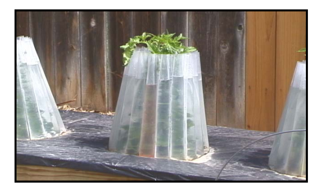
Figure 9. Tomato in Wallof-Water. Notice use of black plastic mulch to warm the soil, another limiting factor of early production. Also, note the plant has grown beyond the device and is now less protected from frost.

Both cold air temperatures and cold soil temperatures are limiting factors in early crop production. When using a Wall-of-Water to start early crops, warm the soil with black plastic mulch. For details on using plastic mulch, refer to CMG GardenNotes #715, Mulches for the Vegetable Garden . In filling the Wall-of-Water, be careful not to splash excessive water onto the soil. A wet soil will be both slow to warm and dry in the spring. Moderately moist soils are best.