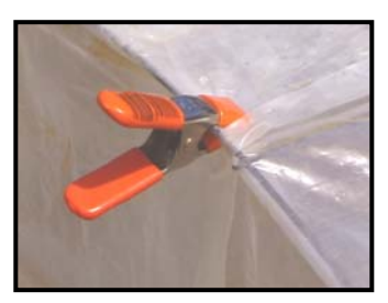
Figure 4. Clip holds plastic on frame.

Hold the plastic onto the frame with small clips available at local hardware stores. Cloths-pins do not hold in the wind. Another method is to use a series of 6-inch wide, belt-like plastic straps arching over the frame (above the plastic cover) and stapled onto the box. Open and close the cover by sliding it between the frame and the belt-like straps. Hold the plastic closed at the ends with a rock or brick. [Figure 4]