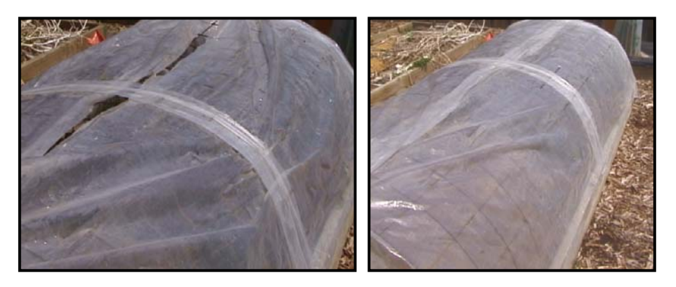
Figure 5. Left: Cover must be opened at least a slit to prevent overheating. Right: Cold frame pictured closed for a cold night.

During the day, the covering MUST be opened, at least a slit, to prevent overheating. With just an hour of sun, temperatures under a closed cover can quickly rise to over 130^{\circ}! [Figure 5]