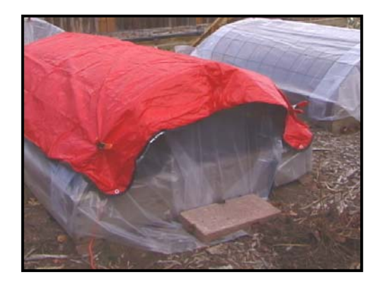
Figure 7. Aluminum space blanket covering a cold frame for extra protection on cold nights.

In trails in Fort Collins, topping a plastic-covered, concrete mesh cold frame with a space blanket prevented freezing when outside temperatures dipped to 0^{\circ} F following a sunny spring day. The space blanket must be removed each day to recharge the soil's stored heat