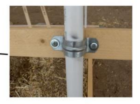
Attach with #8 3/4 inch lath screws